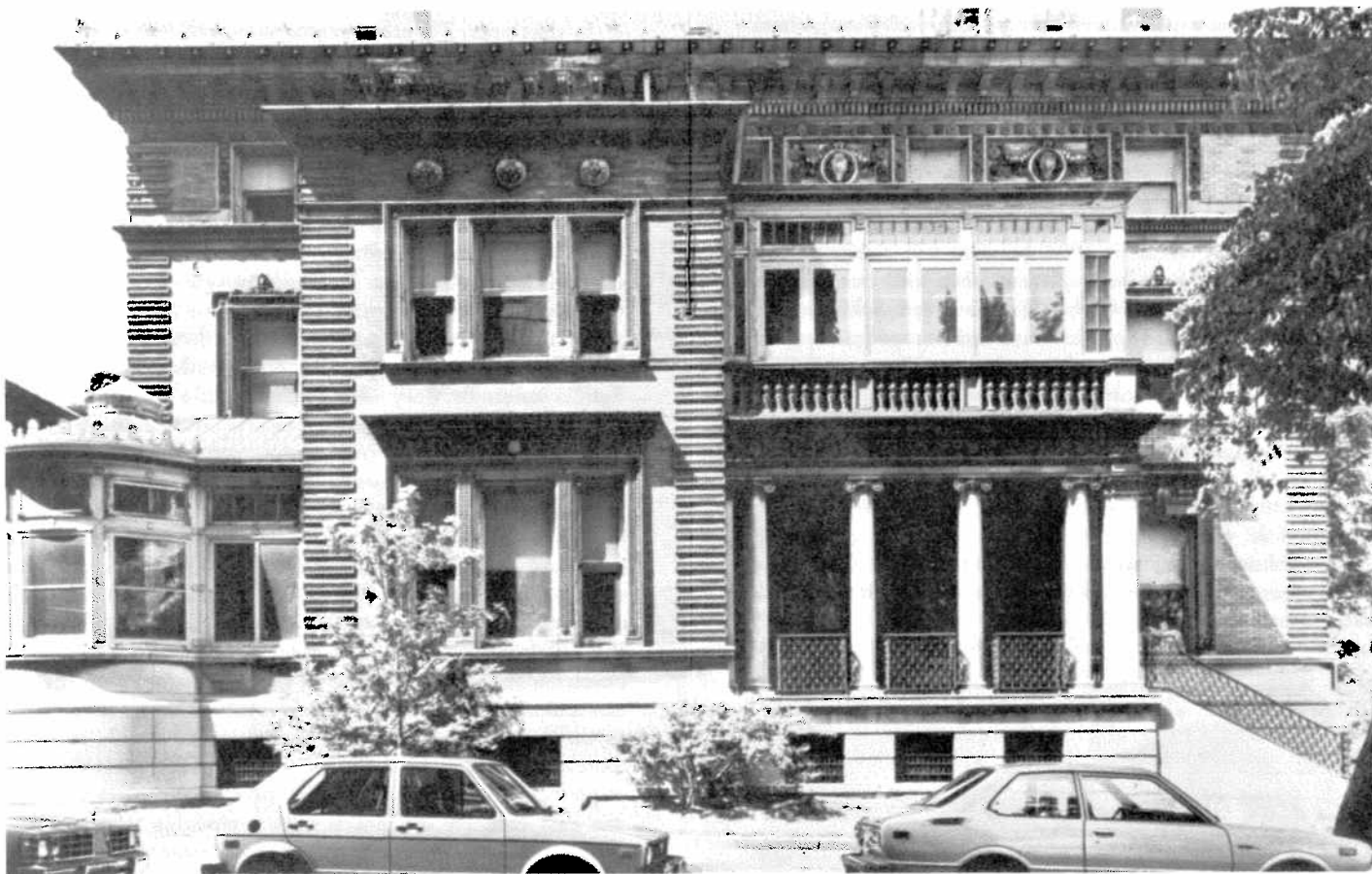
The variety of materials and ornament which give the Theurer/Wrigley House its impressive character is seen clearly on the south side of the building. The basic cubic form is offset by the projecting bay, the conservatory, and the entrance porch. The combination of brick, terra cotta, copper, glass, and wrought iron produces a pleasing visual effect.

The architecture of the late Italian Renaissance was the basis for the massing of Theurer's residence, although its ornament derives from Baroque architecture. The walls of the three main floors are of orange brick with a smooth grey stone used on the base and front stairs. Terra cotta, in its natural orange color, is used extensively: in long narrow bands to form quoins around all the corners of the structure, as frames for the windows, and as a frieze and pediment above the entrance porch. Above each first-floor window is a baroque swag, a scroll bracket, and a decorative lintel. The second-floor windows are treated more simply. The smaller windows of the third floor are framed with smooth bands of terra cotta onto which rosettes were applied. Between these windows are wide swags arranged over circular medallions with shields. Several bands of molding top the structure, and brackets support the projecting cornice. Further terra-cotta ornament is found above the windows in the bays on the east and south facades.